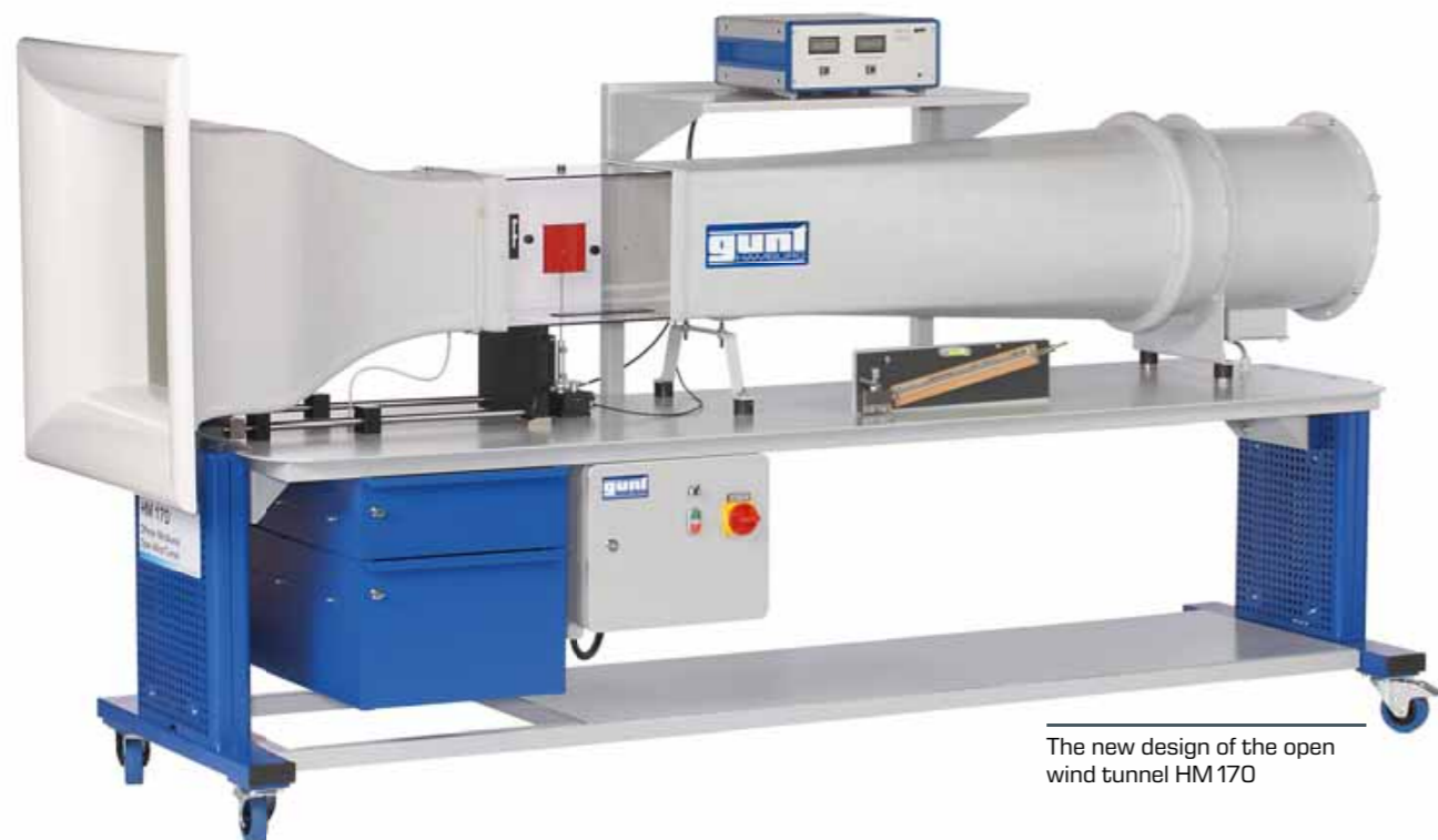
The new design of the open wind tunnel HM 170

uring section. Additional experiments, such as investigation of the boundary layer or pressure distribution of drag bodies immersed in a flow are available as options.