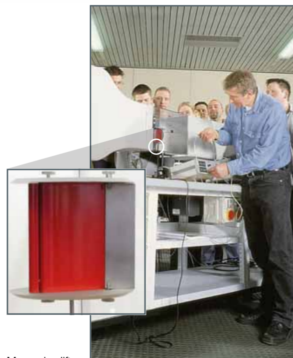
Measuring lift and drag forces as a function of the angle of attack of an aerofoil with flap and slot