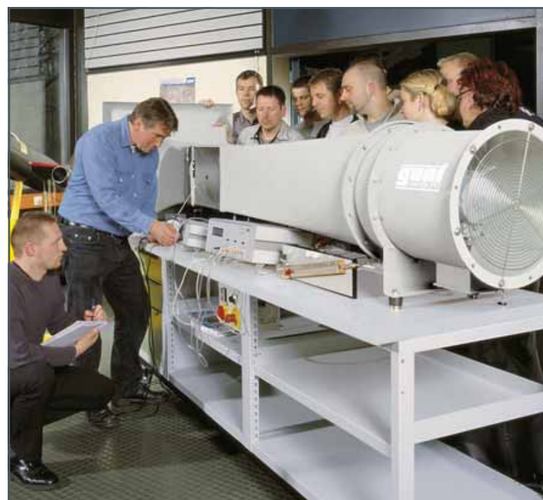
Training at the HM 170 Open wind tunnel at the Technical College for Aeronautical Engineering in Hamburg (Germany)