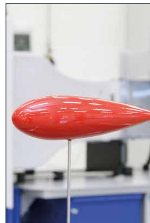
Measuring lift and drag forces on the streamlined body with the two-component force sensor