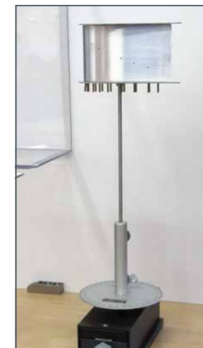
Pressure distribution on an aerofoil immersed in a flow