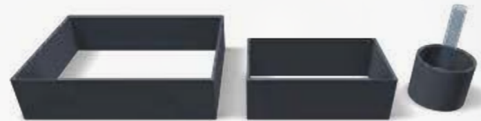
Models for installation in the experiment tank

The core element of HM167 is an experiment tank filled with sand or gravel. You can use different models in the experiment tank to simulate structures. The models can be used to study dykes, excavation pits and wells.