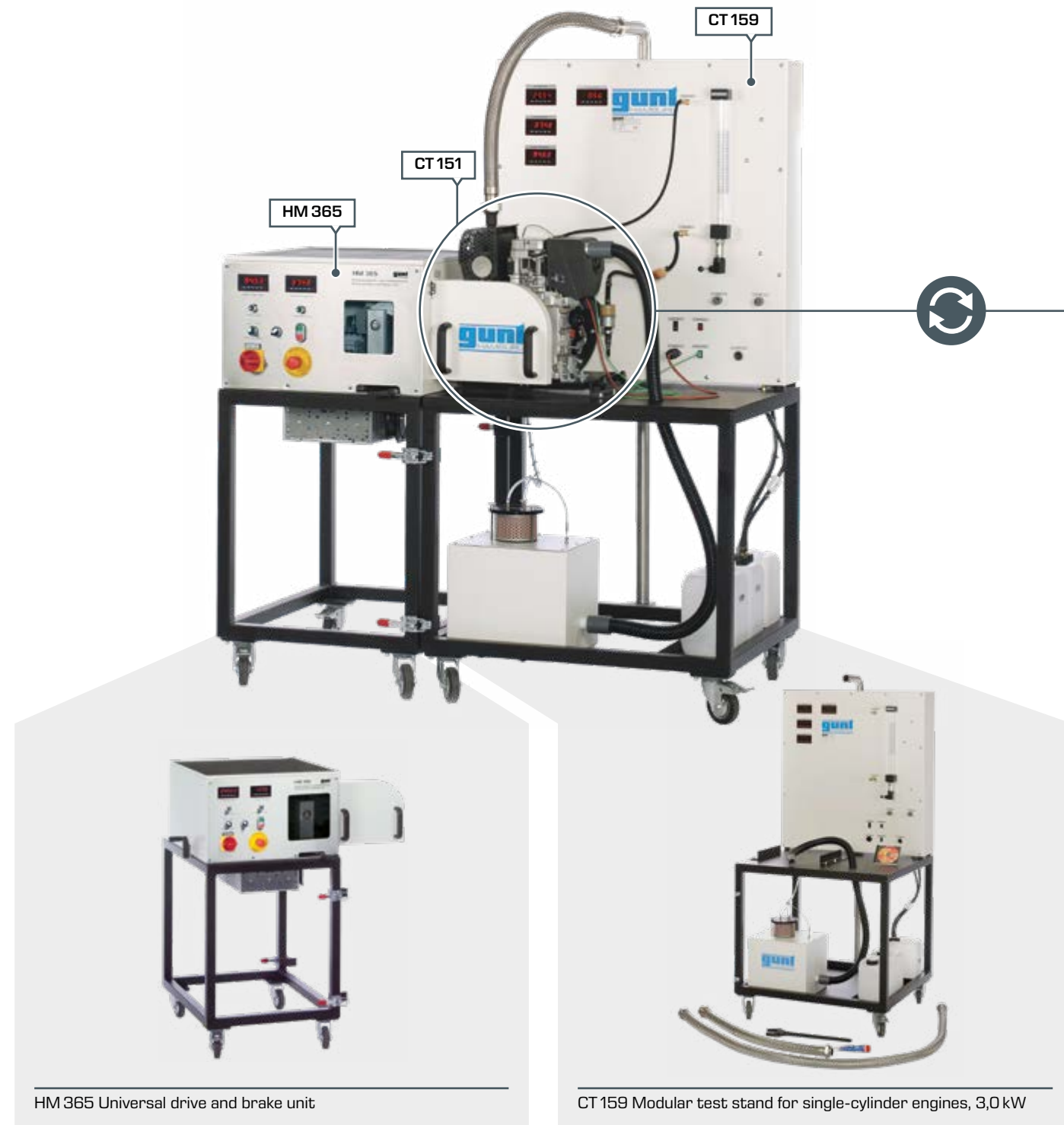
HM 365 Universal drive and brake unit

While the engines are running, HM 365 is operated in generator mode, thus braking the engines. The engines can be examined under full load or under partial load conditions. The characteristic diagram is determined with variable load and speed. The interaction of the brake and engine can also be examined in this context.