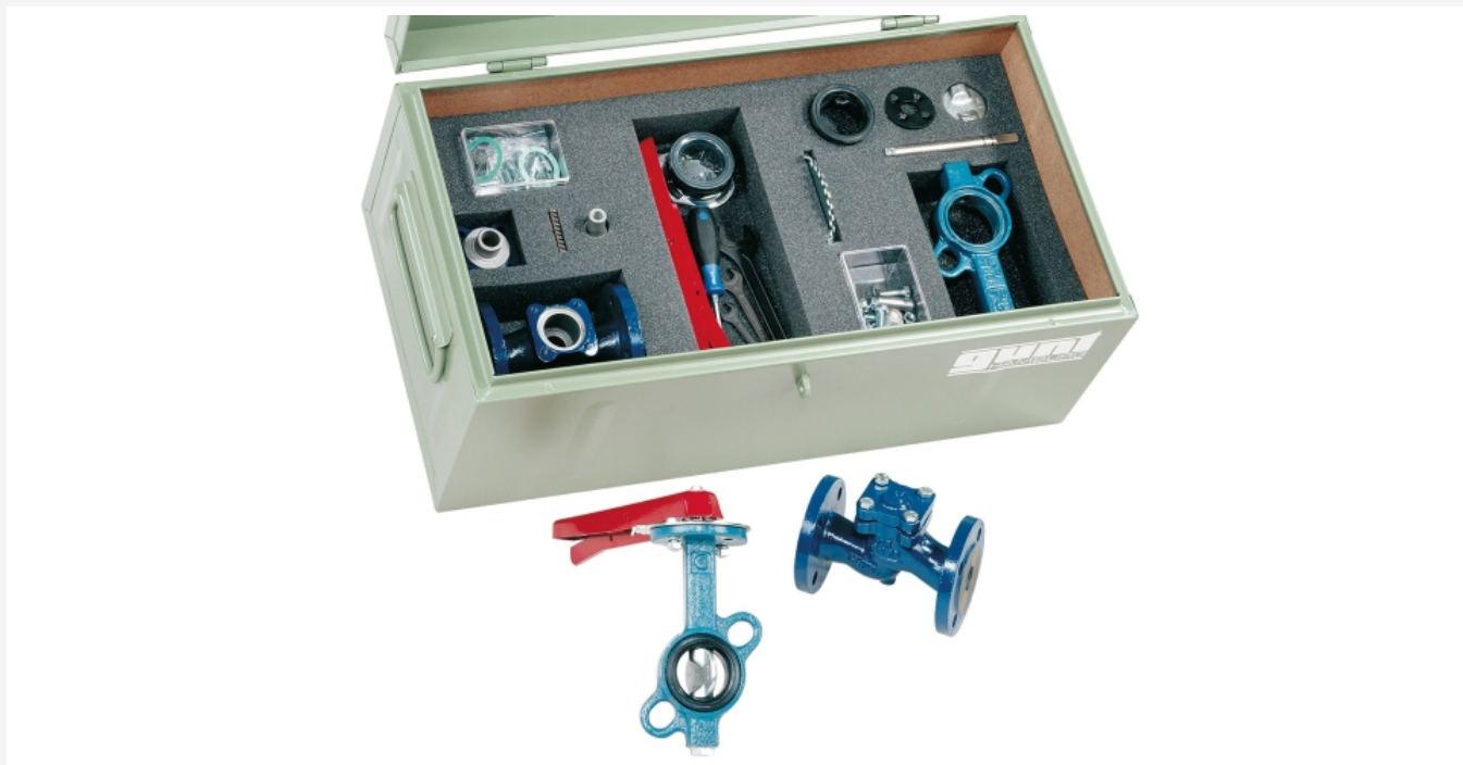
The illustration shows the tool box with kits and tools. In the foreground the valves and fittings as they are assembled from the kits.