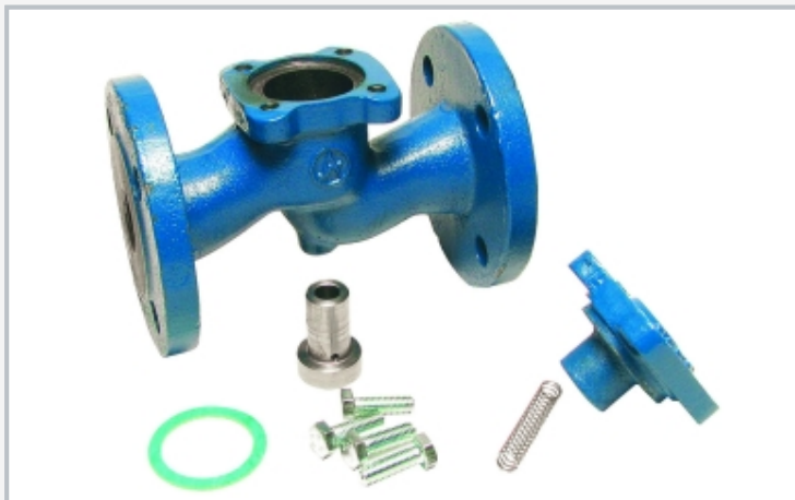
Non-return valve, disassembled