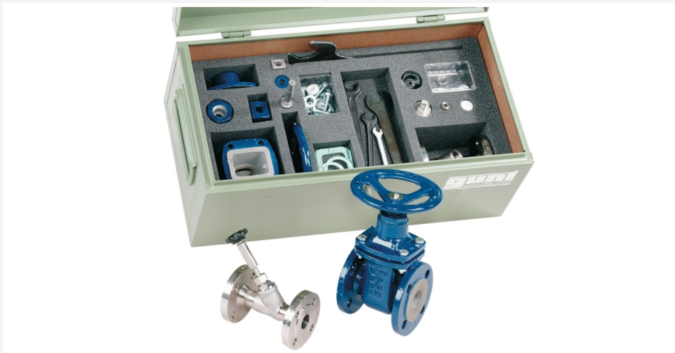
The illustration shows the tool box with kits and tools. In the foreground the valves and fittings as they are assembled from the kits.