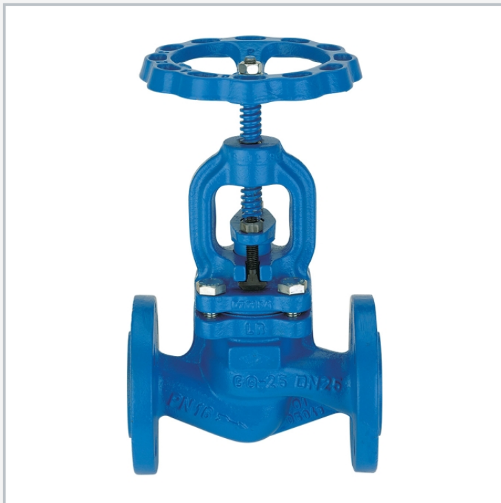
The illustration shows the shut-off valve fully assembled.