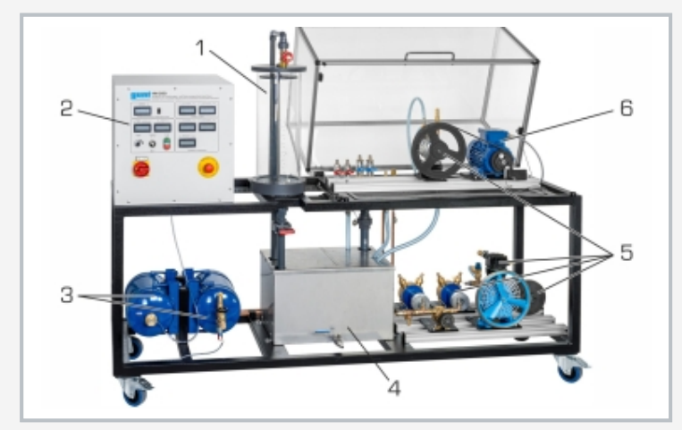
1 measuring tank, 2 displays and controls, 3 stabilisation and pressure vessel, 4 supply tank, 5 pumps and compressor, 6 drive motor