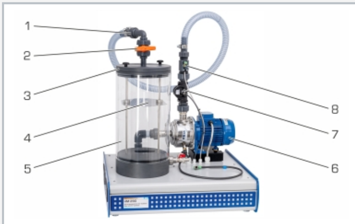
1 water connection, 2 throttle valve for pump experiments, 3 tank cover, 4 damping plate, 5 water tank, 6 pump with motor, 7 pressure sensor, 8 flow meter