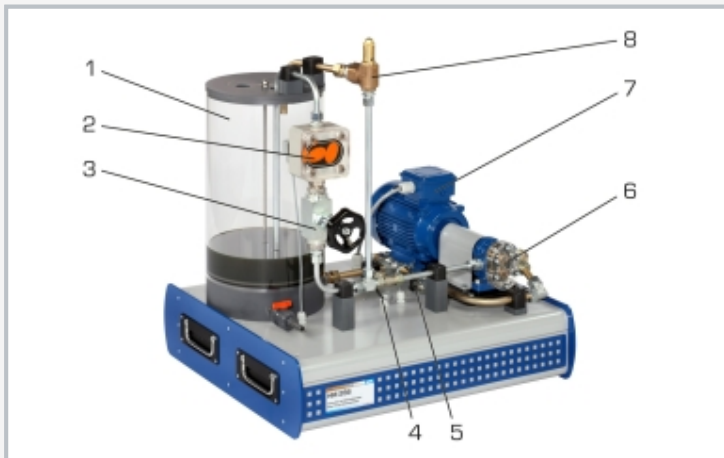
1 tank, 2 flow meter (oval wheel meter), 3 needle valve, 4 pressure sensor at outlet, 5 pressure sensor at inlet, 6 gear pump, 7 drive, 8 overflow valve for adjusting the head