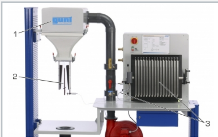
Experimental setup: 1 HM 225, 2 HM 225.02, 3 tube manometers (HM 225) with connection to HM 225.02