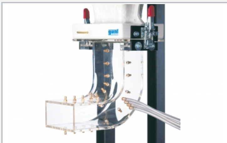
Investigation of flow in a pipe elbow with the accessory HM 225.05