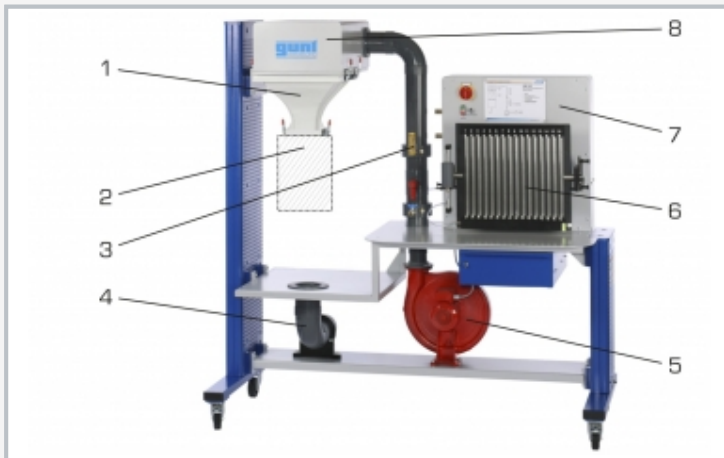
1 nozzle, 2 installation measuring section, 3 thermometer, 4 exhaust air pipe, 5 radial fan, 6 tube manometers, 7 switch cabinet with speed adjustment, 8 stabilisation tank with flow straightener