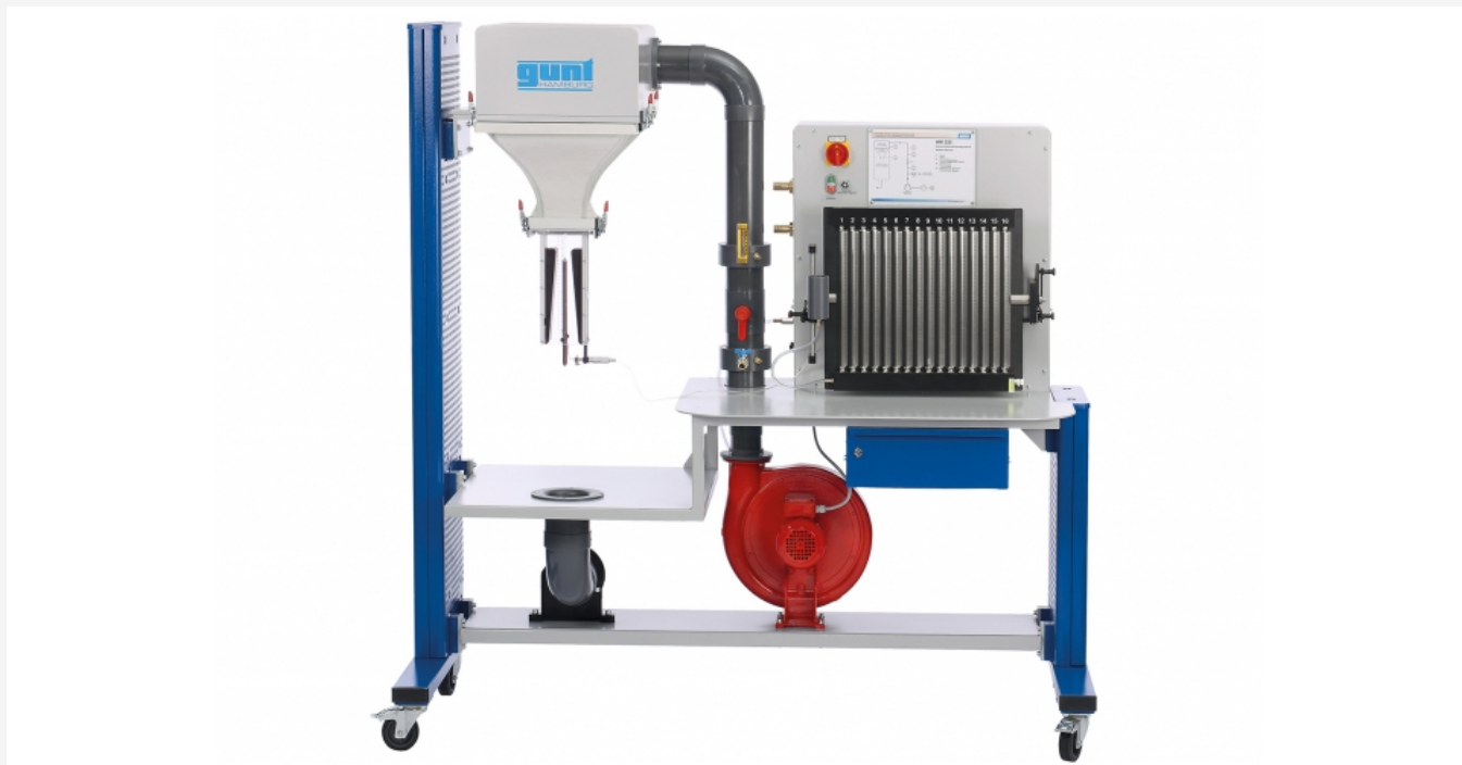
The illustration shows HM 225 together with HM 225.02.