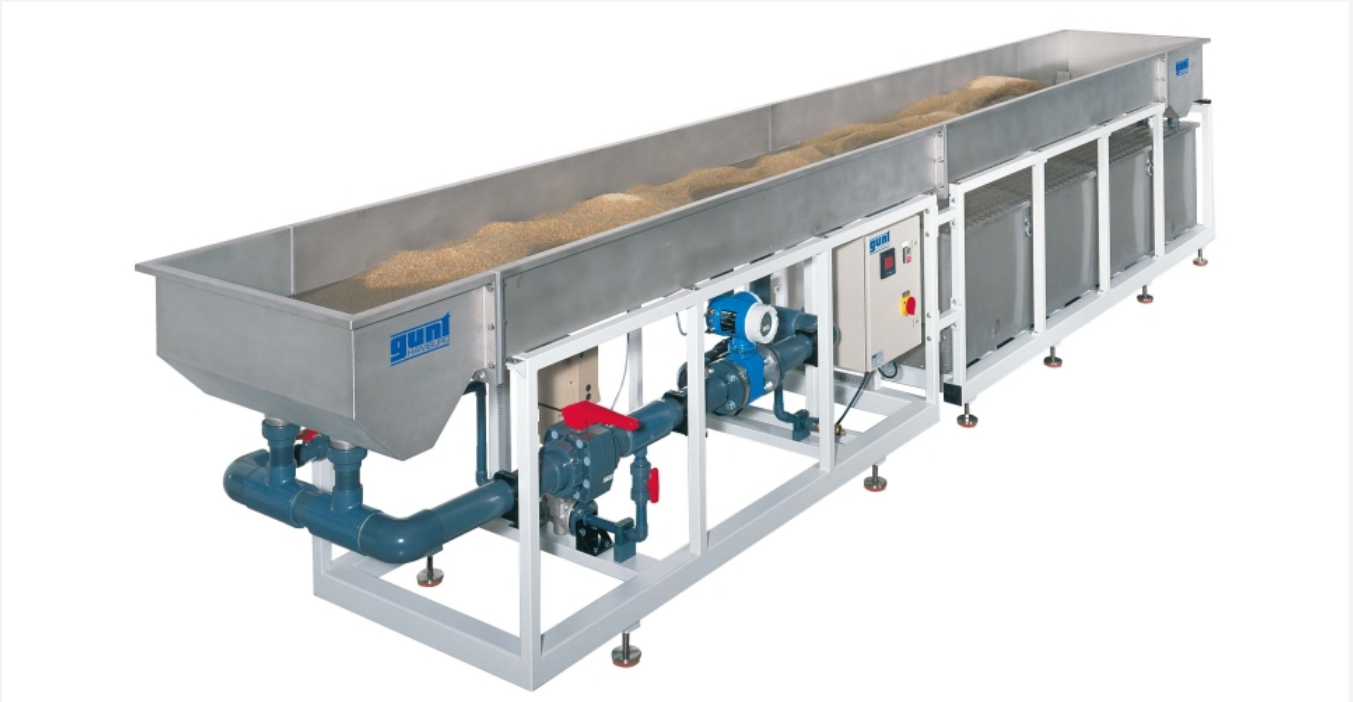
The illustration shows a similar unit