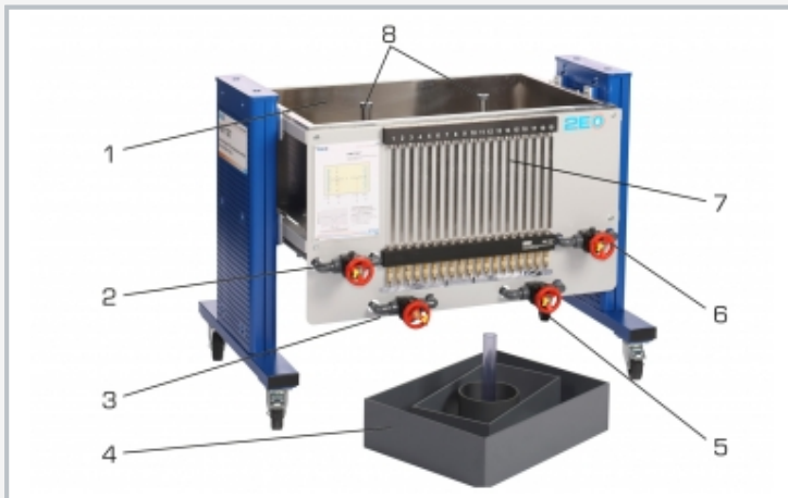
1 tank, 2 water supply, 3 water drain, 4 models, 5 water drain, 6 water supply, 7 tube manometers, 8 water drain via open-seam tube (well)