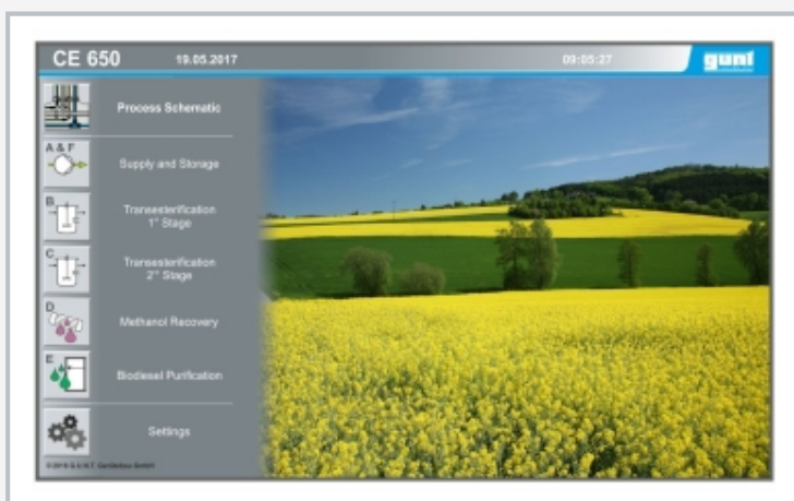
Start screen of the PLC for operation of the experimental plant