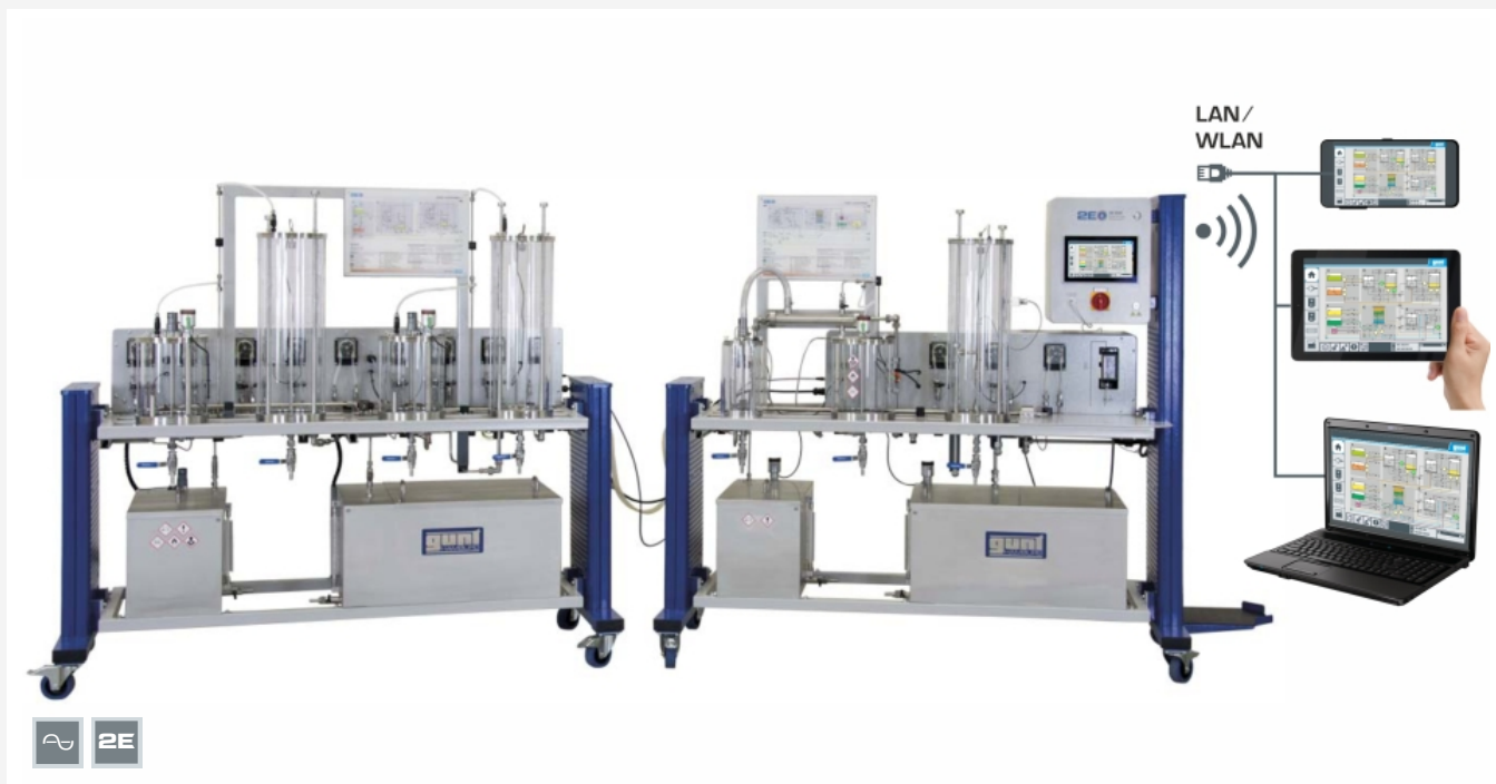
screen mirroring is possible on different end devices