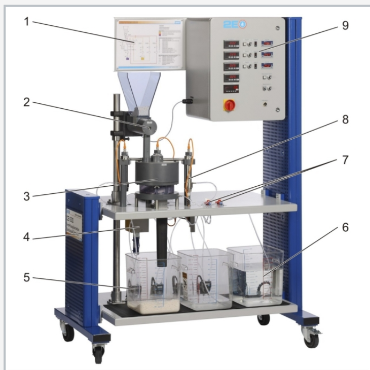
1 process schematic, 2 spiral conveyor for extraction material, 3 revolving extractor, 4 revolving extractor drive unit, 5 pump (behind the tanks), 6 tank, 7 mode selector valves, 8 heater and solvent feed, 9 switch cabinet with controls