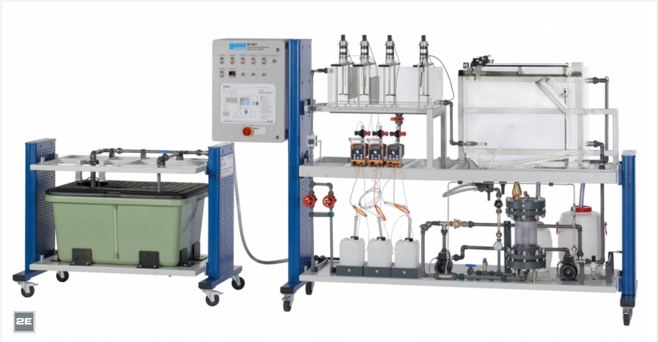
The illustration shows a similar unit: supply unit (left) and trainer (right)