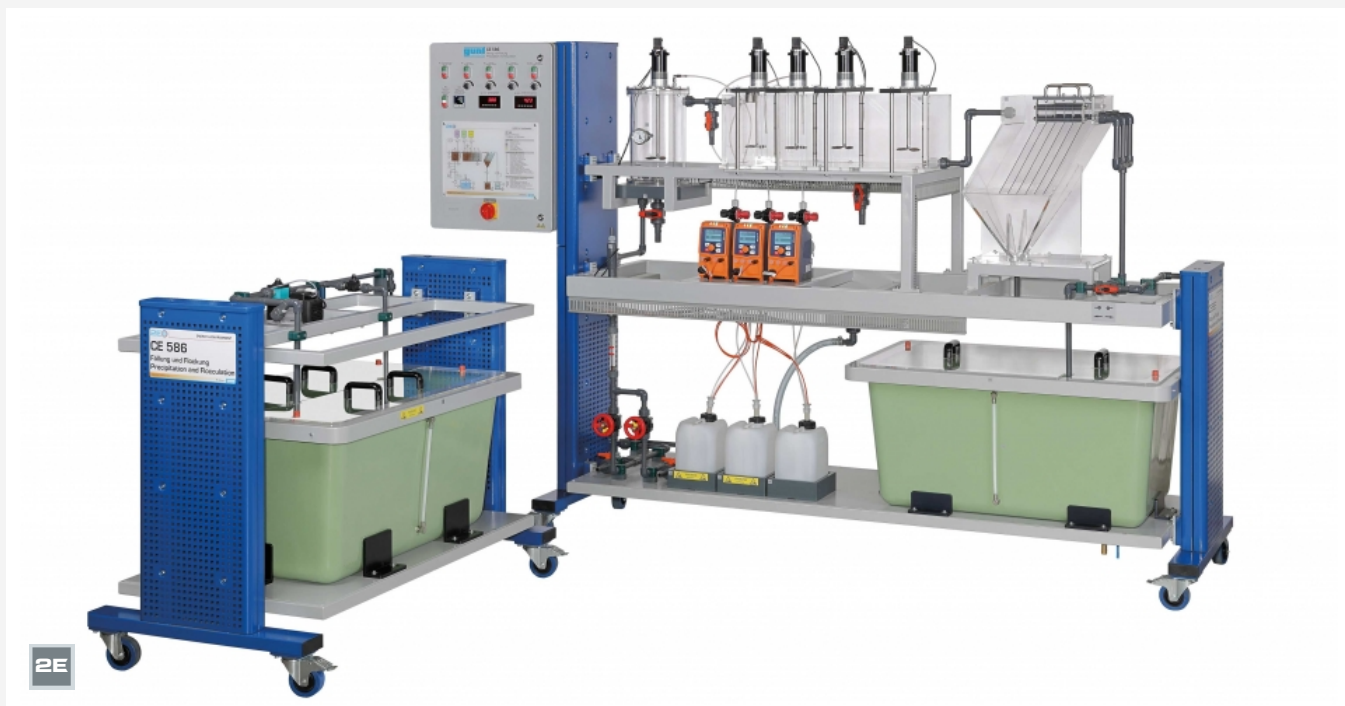
The illustration shows: supply unit (left) and trainer (right).