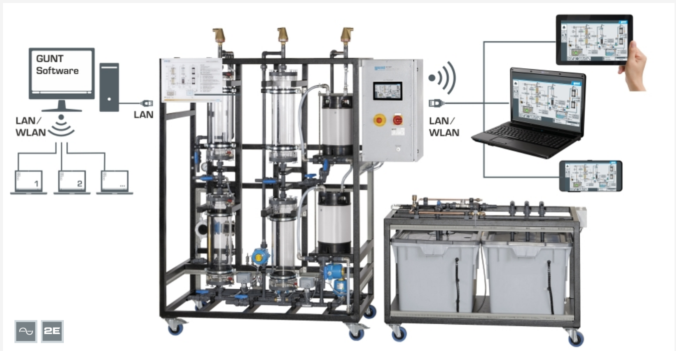
The illustration shows a similar unit: trainer (left) and supply unit (right), screen mirroring is possible on different end devices