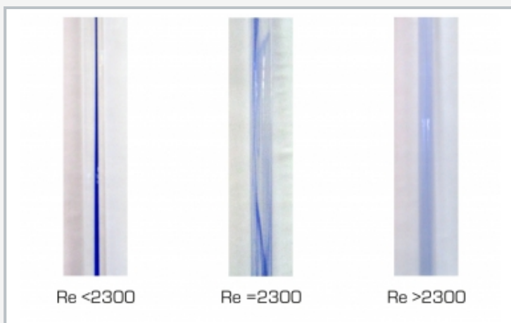
Flow conditions from left to right: laminar flow, transition from laminar to turbulent flow, turbulent flow