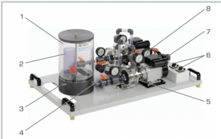
1 tank, 2 overflow, 3 water connection, 4 ball valve, 5 pump, 6 pump switch, 7 drain, 8 manometer