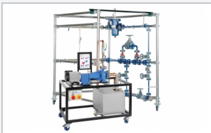
The picture shows HL 960 with a completed specimen installation, in the foreground HL 960.01