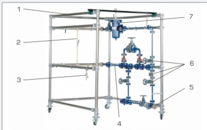
1 mobile frame, 2 DN15 pipe, 3 connection for HL 960.01 (outlet), 4 DN25 pipe, 5 connection for HL 960.01 (inlet), 6 various valves and fittings, 7 pressure vessel with manometer