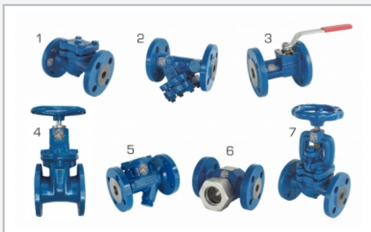
1 non-return valve, 2 strainer, 3 3-way ball valve, 4 Wedge gate valve, 5 steam trap, 6 sight glass, 7 shut-off valve