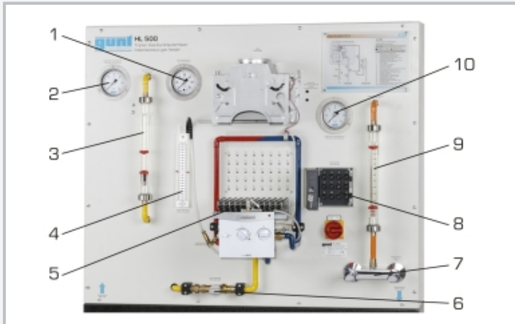
1 gas pressure, 2 water pressure inlet, 3 rotameter for gas, 4 U-tube manometer for differential pressure measurement, 5 instantaneous gas heater, 6 main valve gas, 7 mixer, 8 system faults, 9 rotameter for water, 10 water pressure outlet