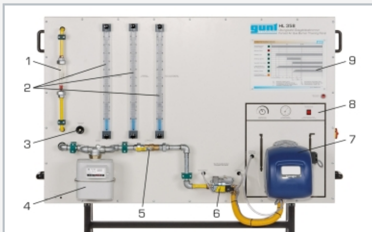
1 flow meter, 2 manometer, 3 valve for gas quantity, 4 gas meter, 5 ball valve, 6 compact fitting, 7 burner, 8 control elements for heating, 9 burner control sequence