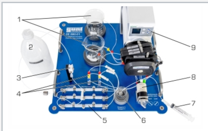
1 tanks for reagents 1 and 2, 2 waste, 3 flow cell, 4 mixing chambers, 5 reaction loop, 6 reagent 3 GOD, 7 injection syringe, 8 injection valve, 9 multi-channel peristaltic pump