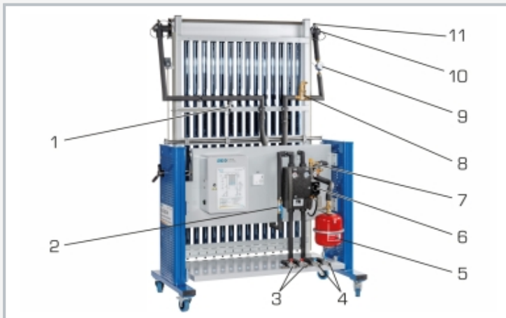
1 pressure sensor, 2 shut-off valve, 3 connectors for hot water, 4 connectors for cold water, 5 diaphragm expansion vessel, 6 circulation pump, 7 pressure relief valve, 8 bubble separator, 9 flow sensor, 10 temperature sensor, 11 vent valve