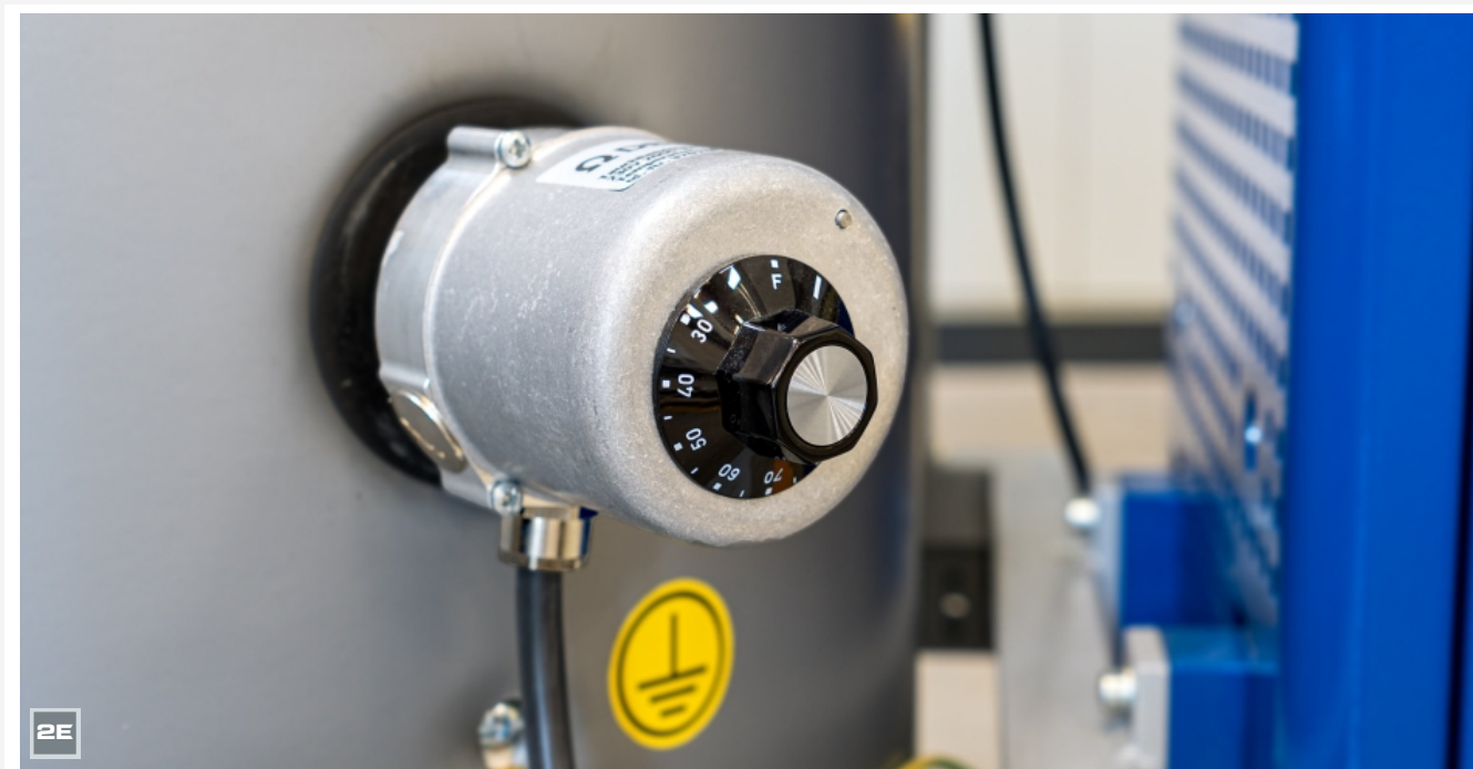
HL 320.02 heater installed in the bivalent storage tank of HL 320.05