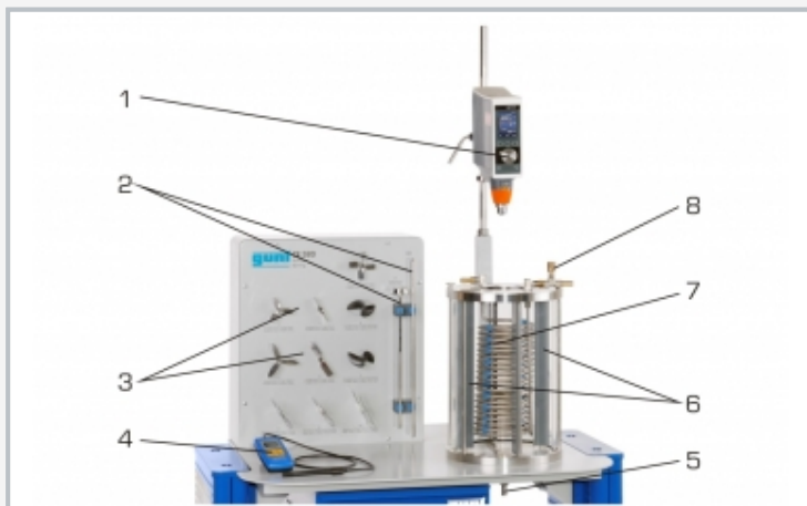
1 stirring machine with speed and torque indicator, 2 turbine stirrer and threaded shaft for stirring heads, 3 stirrer elements, 4 conductivity meter, 5 outlet, 6 flow impeder, 7 coiled tube, 8 shut-off valve for coiled tube