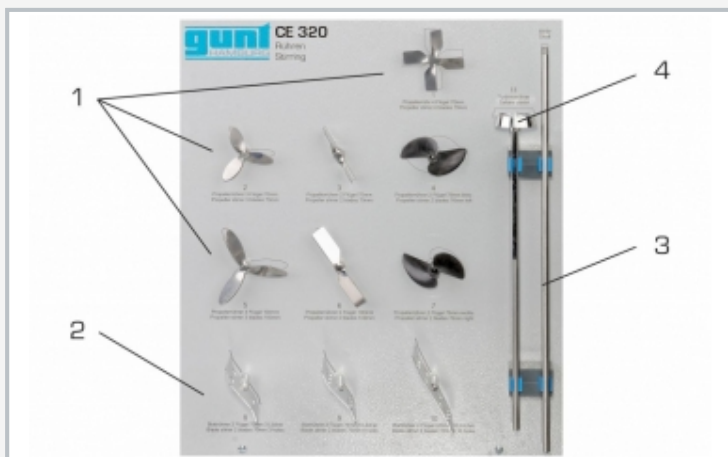
1 propeller stirrers, 2 blade stirrers, 3 threaded shaft for stirring heads, 4 turbine stirrer