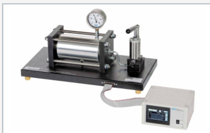
Example application: FL 152 in conjunction with FL 140 (stress and strain analysis on a thick-walled cylinder)