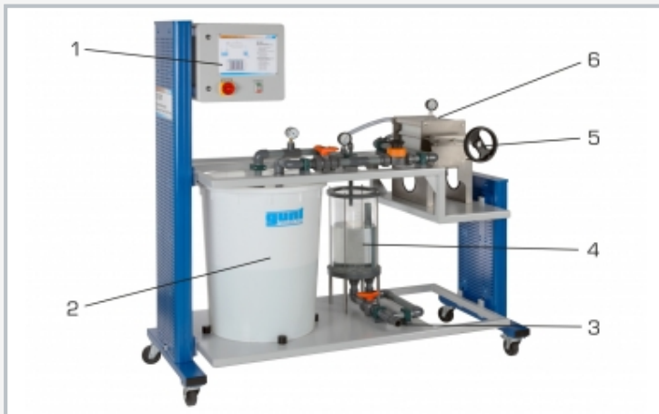
1 switch box with controls, 2 suspension tank, 3 filtrate tank outlet and overflow, 4 filtrate tank, 5 spindle, 6 plate and frame filter press