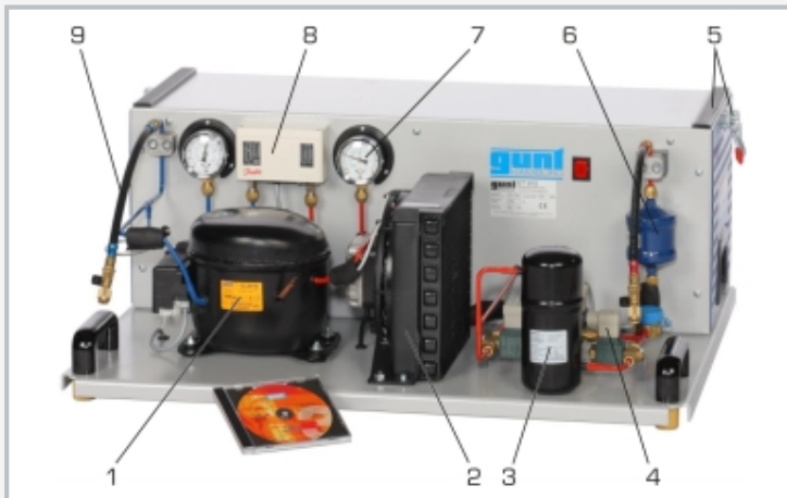
1 compressor, 2 condenser with add-on fan, 3 receiver, 4 solenoid valve, 5 frame to mount the models, 6 filter/dryer, 7 manometer, 8 pressure switch, 9 refrigerant hose