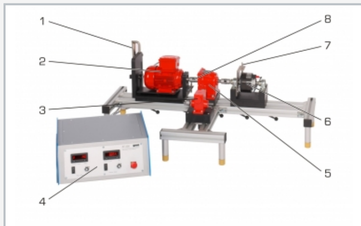
1 spring balance, 2 motor, 3 worm gear, 4 display and control unit, 5 spur gear, 6 brake, 7 brake lever arm, 8 coupling