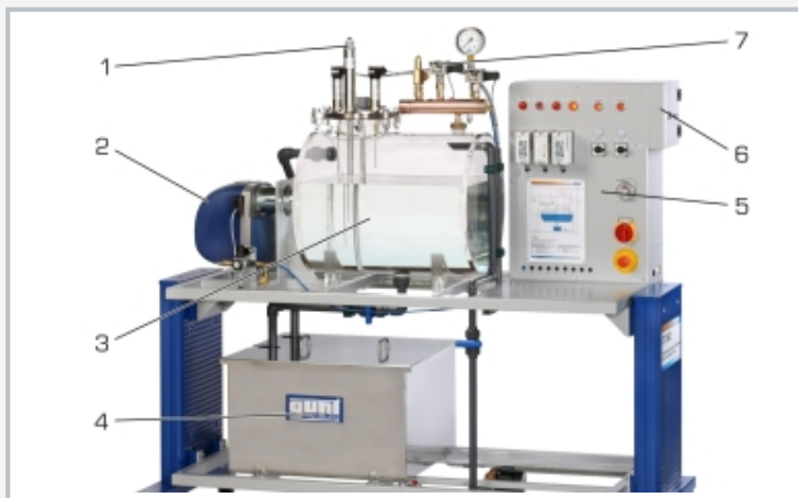
1 water level monitoring, 2 burner, 3 steam boiler model, 4 supply tank, 5 switch cabinet, 6 switch box for fault circuit, 7 pressure measurement equipment