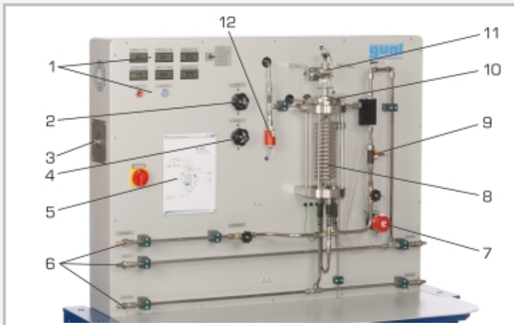
1 displays and controls, 2 valve for sealing steam, 3 steam connection, 4 valve for steam inlet, 5 process schematic, 6 water connections, 7 pressure sensor for condensate measurement, 8 condenser with coil, 9 cooling water flow rate sensor, 10 turbine, 11 eddy current brake, 12 pressure sensor