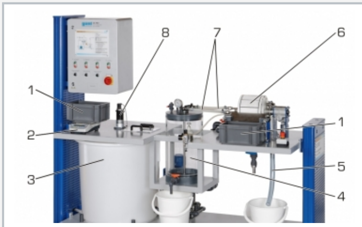
1 filter cake collector tank, 2 balance, 3 suspension storage tank, 4 filtrate vacuum tank, 5 overflow/outlet, 6 drum cell filter, 7 vacuum supply, 8 stirrer