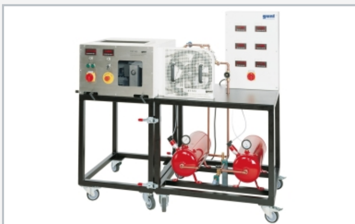
The illustration shows a complete experimental setup with ET 513 and HM 365