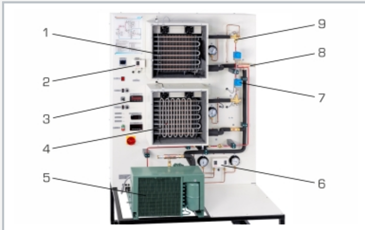
1 refrigeration chamber with heater and ventilators, 2 thermostat, 3 refrigeration controller, 4 refrigeration chamber with heater, ventilators and defrost heater, 5 compressor and condenser, 6 combined pressure switch, 7 solenoid valve, 8 evaporation pressure controller, 9 expansion valve