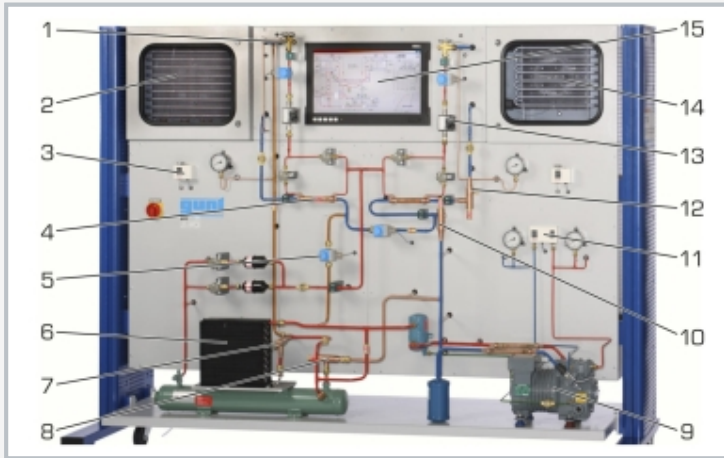
1 expansion valve, 2 freezing chamber, 3 thermostat, 4 heat exchanger, 5 solenoid valve, 6 condenser, 7 condensation pressure controller, 8 capacity controller, 9 compressor, 10 start-up controller, 11 pressure switch, 12 evaporation pressure controller, 13 flow meter, 14 refrigeration chamber, 15 touch panel PC