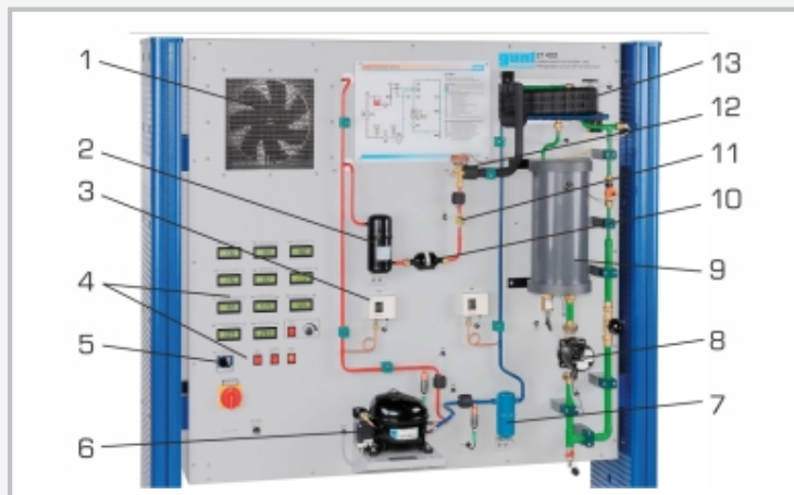
1 condenser with ventilator, 2 receiver, 3 high pressure switch, 4 displays and controls, 5 heater controller, 6 compressor, 7 liquid separator, 8 pump, 9 warm water tank with heater, 10 filter/drier, 11 sight glass, 12 expansion valve, 13 evaporator