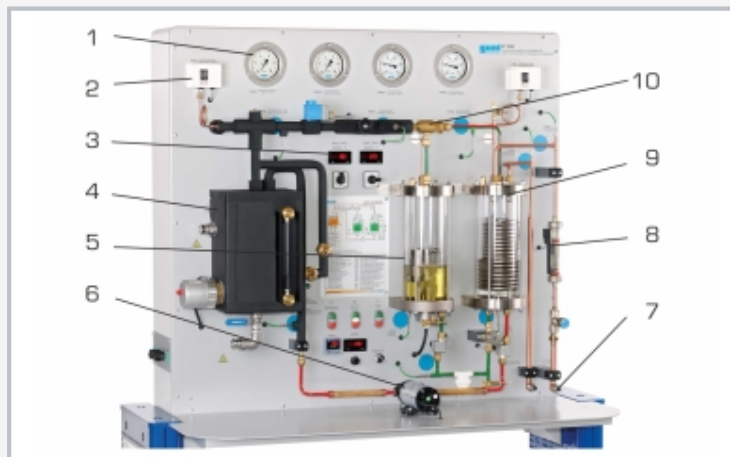
1 manometer, 2 pressure switch, 3 displays and controls, 4 vapour generator, 5 evaporator, 6 pump, 7 cooling water connections, 8 flow meter, 9 condenser, 10 vapour jet compressor