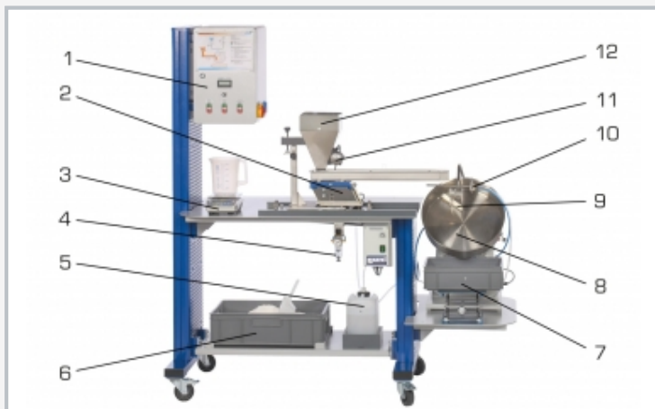
1 switch cabinet, 2 solid material metering device, 3 balance, 4 pressure reducing valve, 5 granulating liquid tank, 6 solids tank, 7 agglomerate tank, 8 dish granulator, 9 scraper, 10 two-component nozzle, 11 vibrator, 12 solids silo