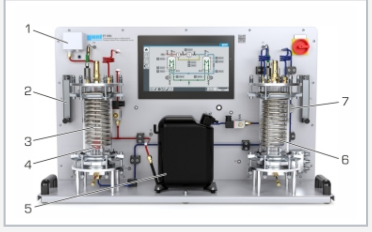
1 pressure switch, 2 flow meter, 3 condenser, 4 expansion value, 5 compressor, 6 evaporator, 7 sight glass