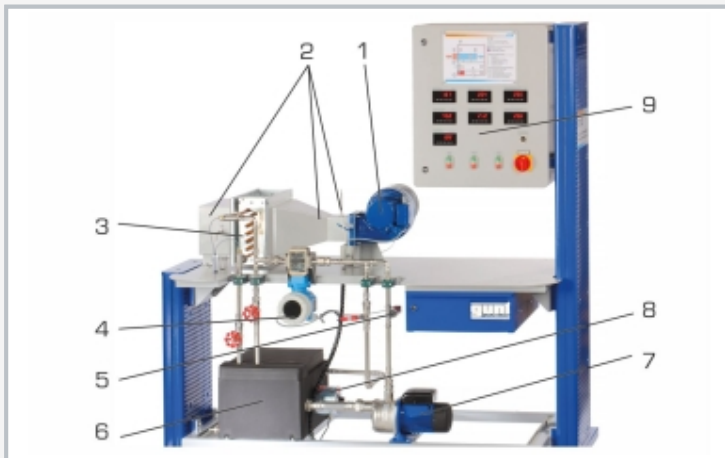
1 fan, 2 air duct with temperature measuring points, 3 heat exchanger, 4 flow meter, 5 pressure sensor, 6 water tank, 7 pump, 8 heater with thermostat, 9 displays and controls