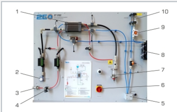
1 fuel cell, 2 cathode blower, 3 low-pressure reducing valve, 4 inlet valve, 5 cooling water pump, 6 main switch, 7 water separator, 8 water cooler, 9 visual flow indicator, 10 cooling water tank