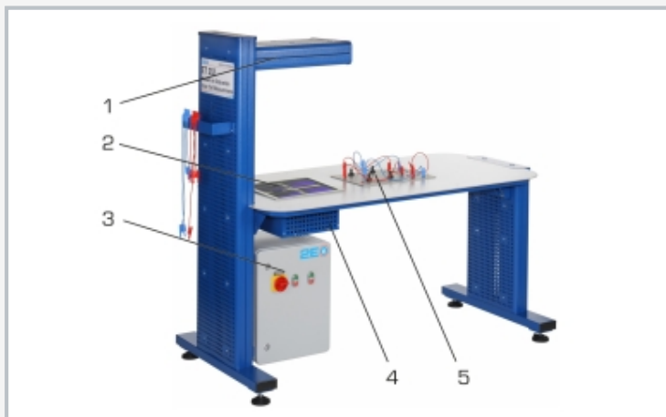
1 lighting unit, 2 four monocrystalline Si solar cells, 3 control unit, 4 Peltier module, 5 patch panel