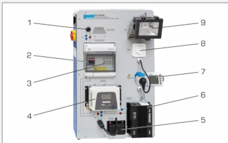
1 connector for photovoltaic modules, 2 DC switch-disconnector, 3 over voltage protection, 4 charge regulator, 5 accumulator, 6 inverter, 7 energy meter, 8 dimmer, 9 halogen lamp