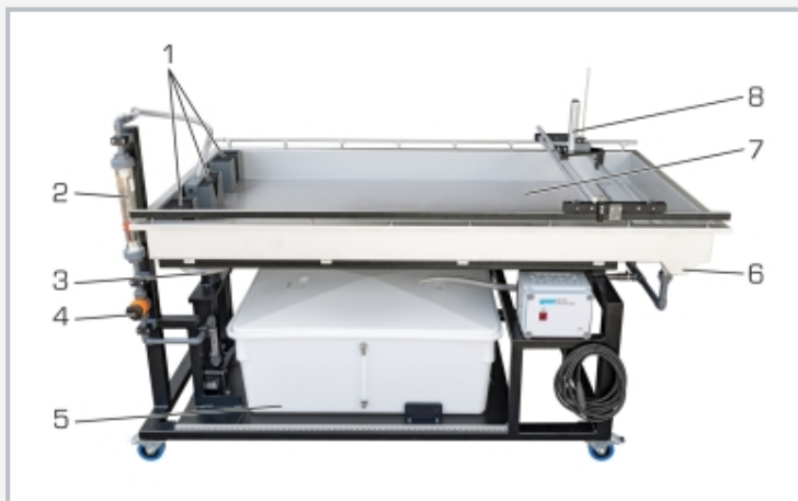
1 inlet elements, 2 flow meter, 3 inclination adjustment, 4 valve, 5 storage tank, 6 outlet element with filter, 7 experimental section, 8 point gauge