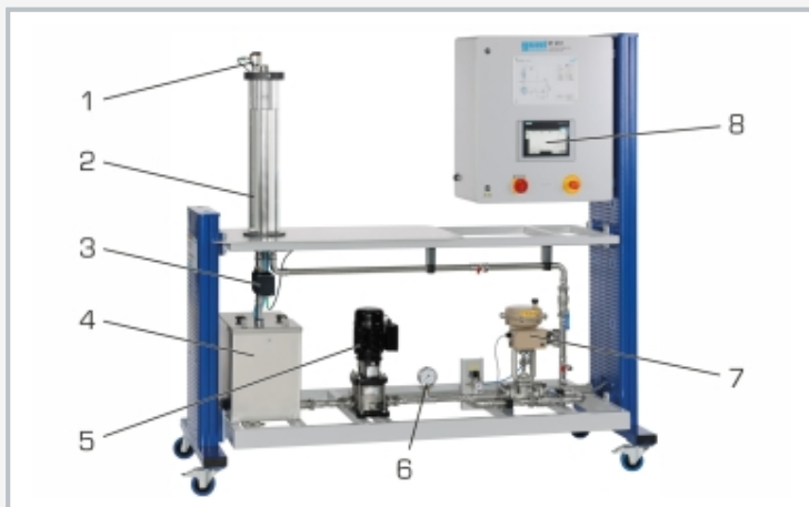
1 smart level sensor, 2 transparent tank, 3 proportional valve with motor drive, 4 storage tank, 5 pump, 6 manometer, 7 control valve, 8 touch screen