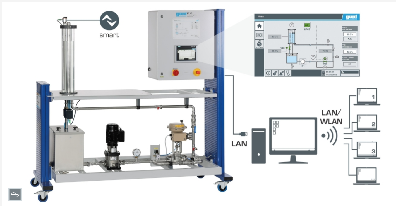
Control and operation via touch screen or a PC with GUNT software. Observation and analysis of the experiments at any number of workstations via LAN/WLAN.