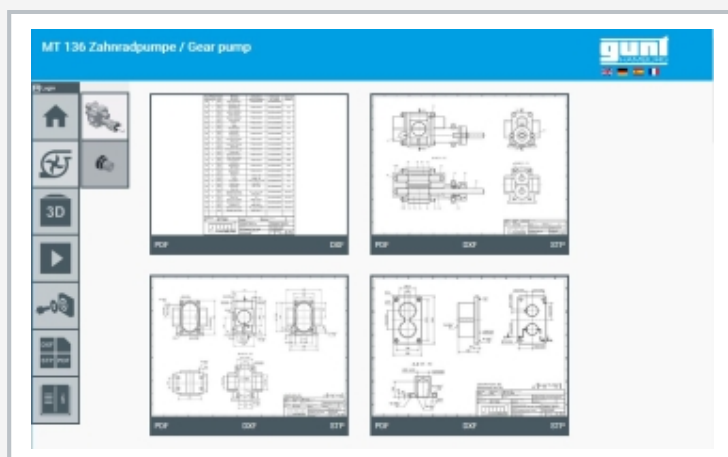
Screenshot of the GUNT Media Center