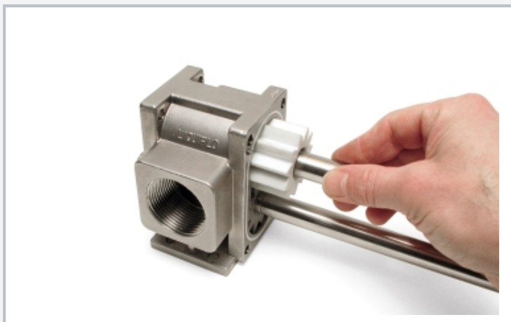
Gear pump assembly: fitting the drive shaft