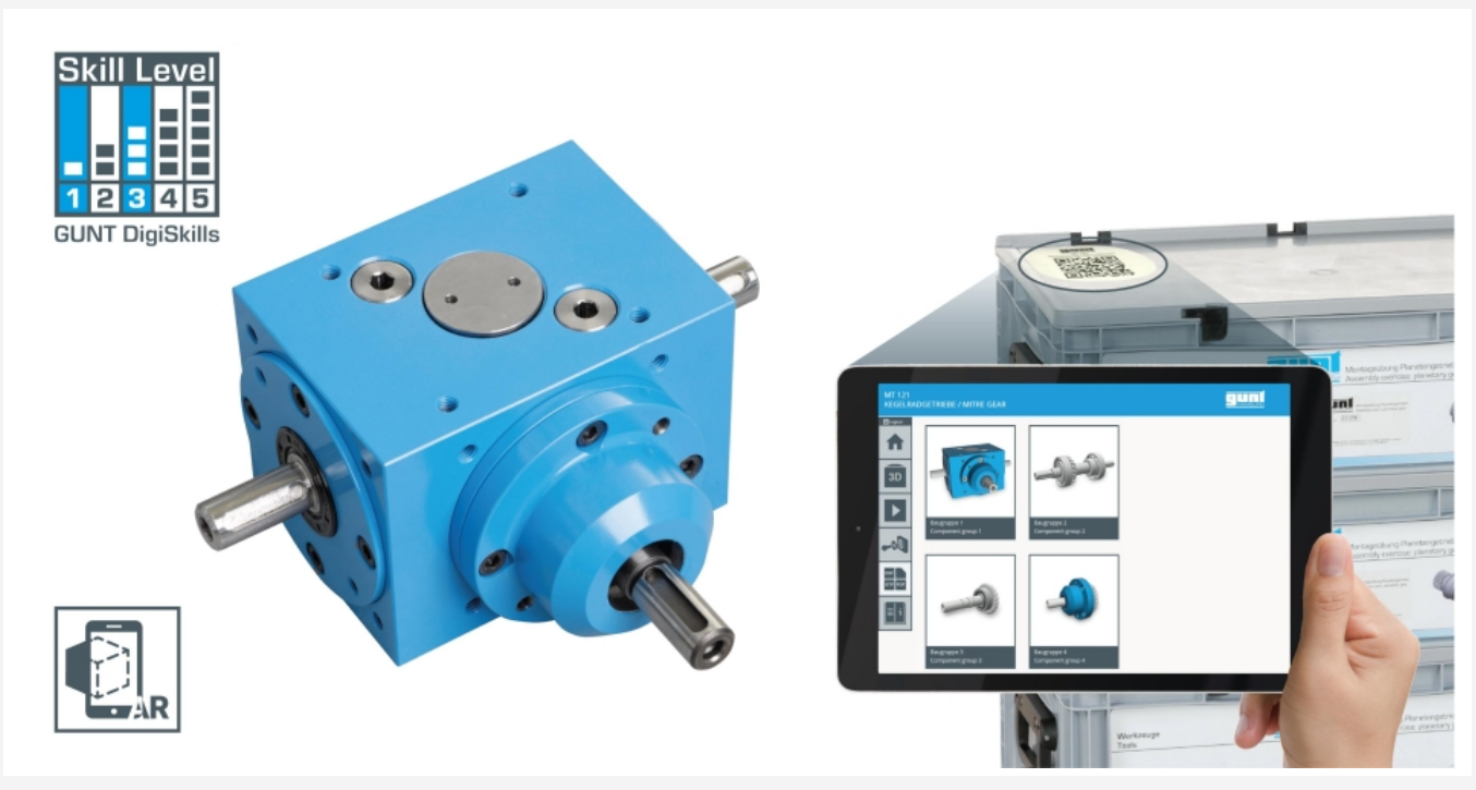
The illustration shows the assembled gear and the GUNT Media Center on a tablet (not included)