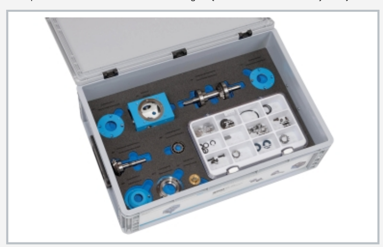
\ensuremath{\mathsf{MT}} 121: storage system with foam inlay, all components have their place, the foam is labeled