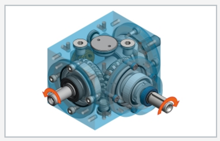
Transparent sectional view of the assembled gear (screenshot from assembly video)