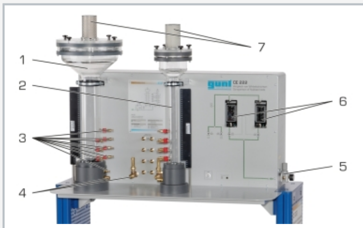
1 column K1 with \varnothing 100mm, 2 column K2 with \varnothing 50mm, 3 differential pressure measuring points of K1, 4 gas supply for K1, 5 gas supply to the trainer, 6 flow measurement for 2 measuring ranges